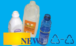
#1-7 plastic bottles & jugs