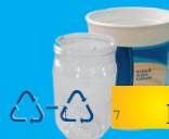
#1-7 plastic tubs & screw-top jars